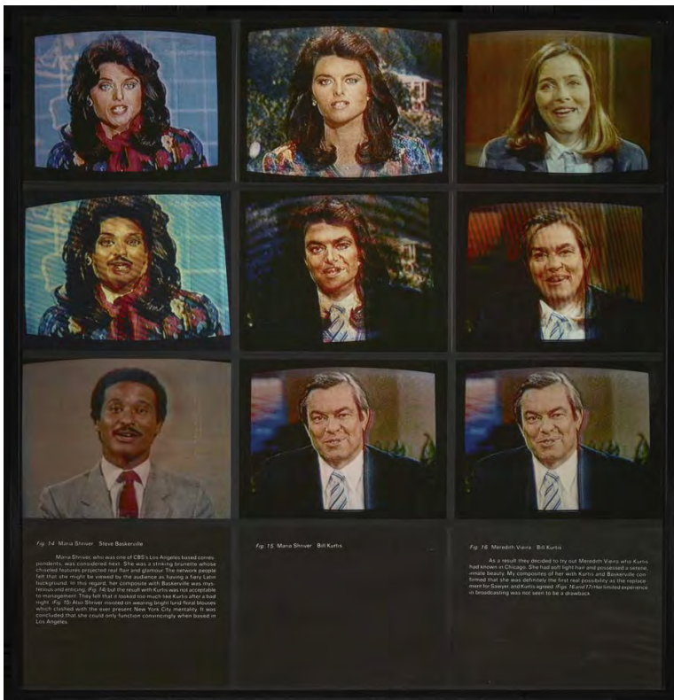
Robert Heinecken, A Case Study in Finding an Appropriate TV Newswoman (A CBS Docudrama in Words and Pictures), 1984, silver-dye bleach prints, 1.1 x 1.1 m. Courtesy: Hammer Museum, Los Angeles © The Robert Heinecken Trust