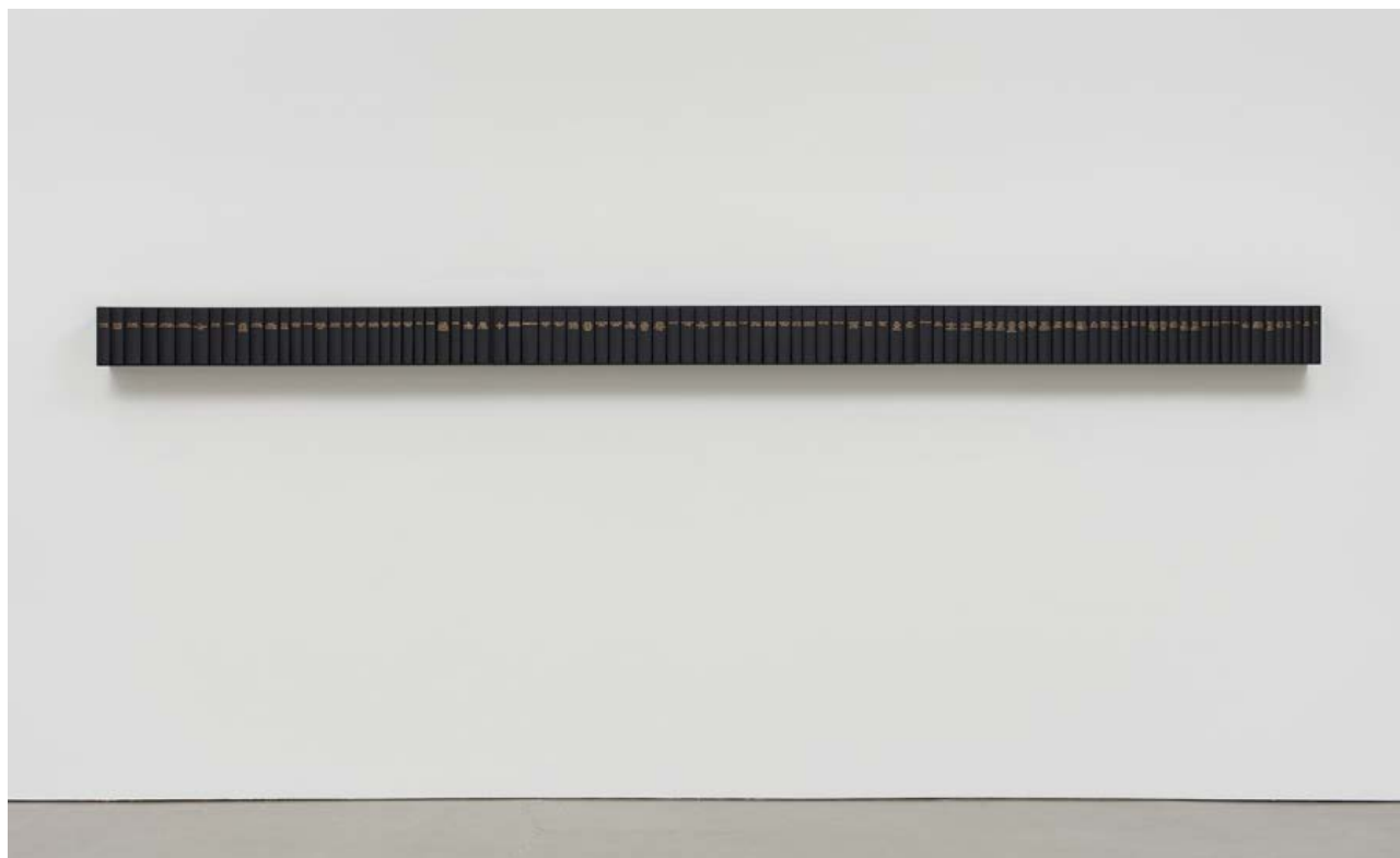
Theaster Gates, West Side Story , 2017, bound Jet magazines, steel shelves, 21 x 432 x 16 cm. Courtesy: Regen Projects, Los Angeles © Theaster Gates

I saw the show one day before Donald Trump's inauguration, two days before joining some 750,000 others at the Women's March on LA, and three days before our new President signed an executive order barring foreign aid from going to any NGO that provides abortions or even discusses them as a family planning option.